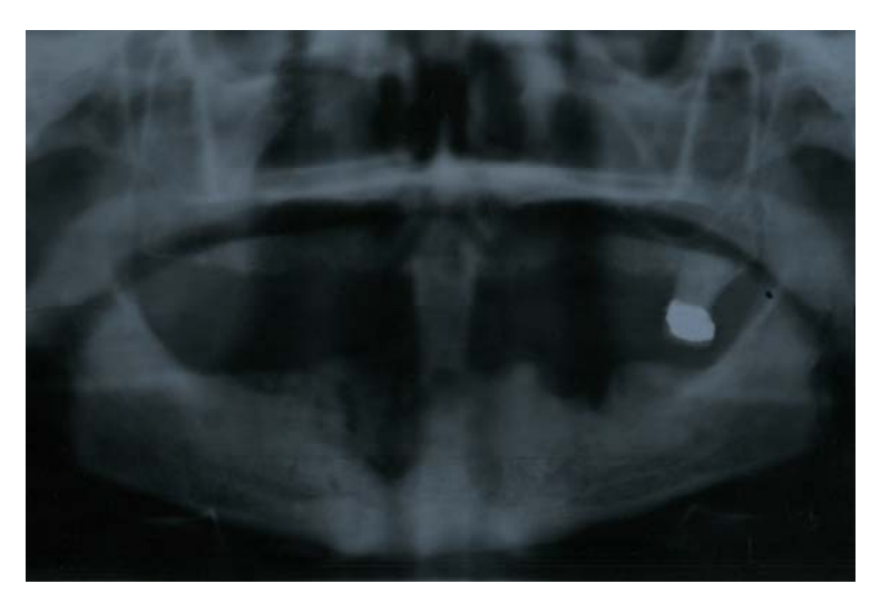
Figure 1 – X-ray of patients with multiple myeloma (case 1) Слика 1 – Ріш і снимка на йациеній со миелом (случај 1)

The first case is a male patient 55 years old, diagnosed with IgA myeloma, stage III according to the Durie-Salmon staging system, in February 2008. He had multiple lytic lesions on bone survey with intensive back pain and signs of renal insuffiency with elevated serum urea and creatinine levels. Renal insuffiency was treated conservatively and there was no need for haemodialysis. Initially he was treated with four cycles of VAD (Vincristine/Doxorubicine/Dexamethasone); haematological remission was not achieved, so he continued with 4 cycles of COMP (Cyclophosphamide, Vincristine, Melphalan, Prednisone) chemotherapy, until Thalidomide became available. From October 2008 he was treated with Melphalan/Prednisone/Thalidomide (MPT) protocol and a standard dose of ibondronate orally (50 mg per day). Therapy with oral ibandronate was stopped due to X-ray signs of ONJ in august 2009 (Fig. 1) and the diagnosis was patohistologically confirmed (Fig. 2). Therapy with broad spectrum antibiotics (Amoxicillin+Clavulonic acid) was started. Now he is treated only with MPT chemotherapy.