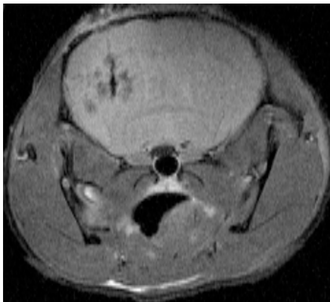
Figure 2 – In vivo T2-weighted spin echo coronal image of mouse brain (TE = 15 ms, TR = 1200 ms) showing the site inoculated with the MRI transgene L*H Ft on the left and Lac Z control on the right

Слика 2 – In vivo коронална снимка на ѓлувчешки мозок рондерирана во T2 (TE = 15 ms, TR = 1200 ms), рокажувајќи ја локацијата на MP ѓрансгенои L*H лево и Lac Z конѓролаѓа десно