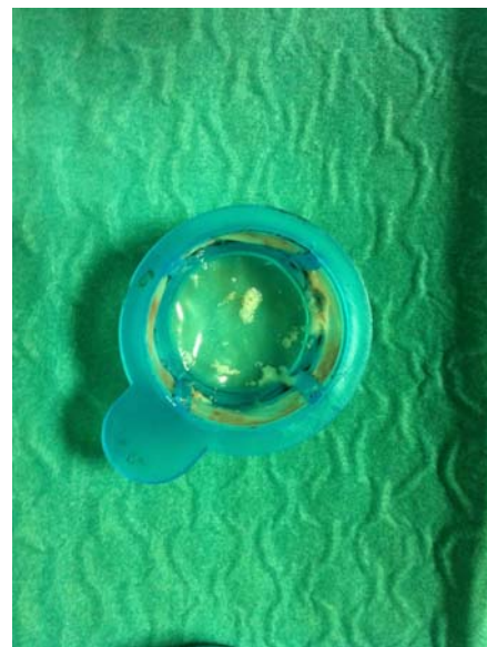
Picture 1 – White thrombus is mainly composed of platelets and small number of fibrin, red cells and leukocytes it is known as s arterial thrombus

Besides the presence of "scavenger" cells (cells that collect cellular debris), the rest of the debris contributes immensely to the apoptotic cells turning into secondary necrosis that leads to additional inflammation. This creates a micro-environment where matrix degeneration predominates and deregulates the previous balance where collagen deposition allows the creation of stable coarsening. In time, as the fibrin cap weakens, the plaque destabilizes, while the mechanical structure that holds the lesion containing the necrotic core and inflammatory cells is compromised. The Brown study emphasizes that lesions in the coronary arteries are deposits of huge quantities of foamy cells and fibrous plaques. The thin fibrous plaques are 10–20% of the total plaque population and are the cause of 80–90% of clinical cases due to their ability to rupture [48]. According to virtually all the results from published studies, it has been pointed out that the plaque stability, not the absolute size, influences the rupture potential. Since the plaques form in the regions of non-lamellar blood flow, the haemodynamic factors cause mechanism stress of the plaque, creating a mechanism for endothelial erosion and an opportunity for rupture, exposing procoagulant stimuli under the endothelium (tissue factor) in the blood flow [49, 50]. (Fig. 1, Fig. 2).