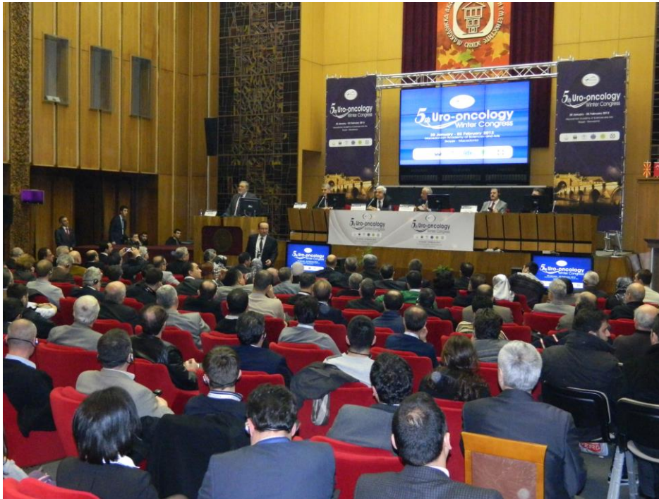
Fig. 2 – Opening ceremony of the Congress