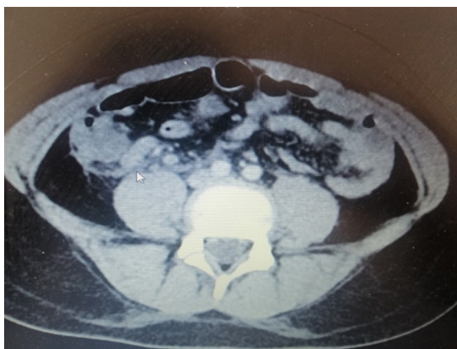
Figure 2. CT of inflamed appendix in a patient with multisystem inflammatory disease related to COVID-19

ygen support. High doses of intravenous immunoglobulin (1g/kg) were given.